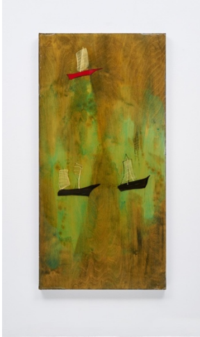
Dreams of Sails, 2019 Wood, pigment, resin $2,000 each