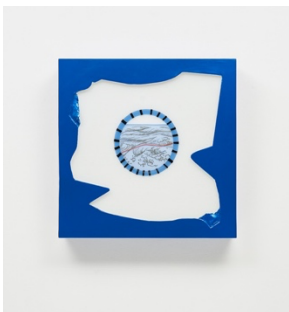
Franconia, 2022 Wood, glass, urethane paint 24 x 24 x 5 inches $4,500