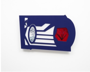
Across the River, 2022 Wood, glass, urethane paint 33 x 22 x 3 inches $4,500