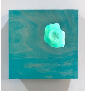
Island, 2022 Wood, pigment, glass, LED light 18 x 18 x 2 inches $900