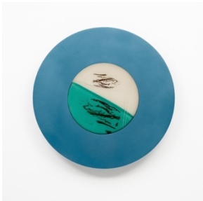
The Moon is Down, 2022 Wood, glass, urethane paint 24 x 24 x 3 inches $4,000