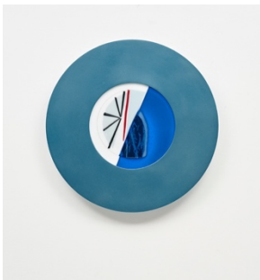
Waves, 2022 Wood, glass, urethane paint 24 x 24 x 3 inches $4,000