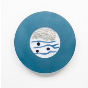
River Dreams, 2022 Wood, glass, urethane paint 24 x 24 x 3 inches $4,000