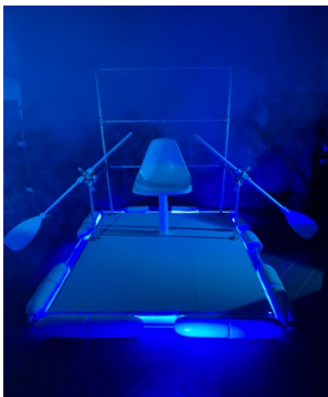
Raft, 2022 Steel, plastic, LED lights, video over the Hudson River Dimensions variable $6,500