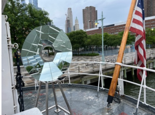
Radar Kaleidoscope, 2022 Steel, mirror 74 x 38 x 28 inches $6,000