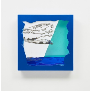
Oceanite, 2022 Wood, glass, urethane paint 24 x 24 x 5 inches $4,500