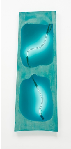
Thunder Waves, 2022 Wood, neon lights 51 x 17 x 2 inches $2,500